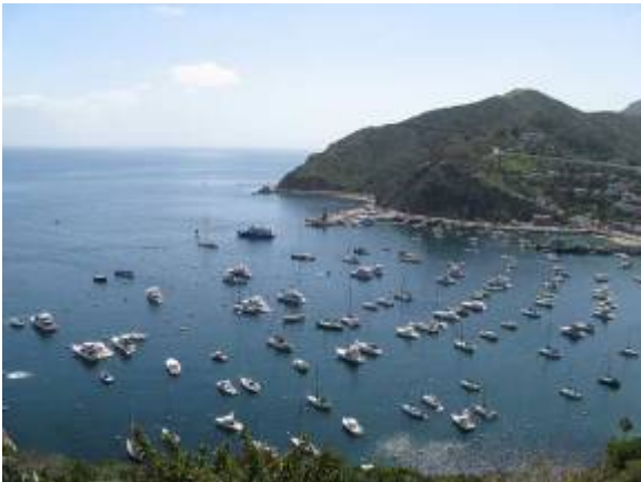
Another lousy day in Avalon