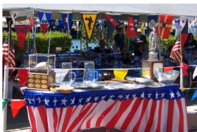
The colorfully decorated trophy table at Opening Day

For more Opening Day pictures, go to our website at" http://hyc.scyweb.org/ "